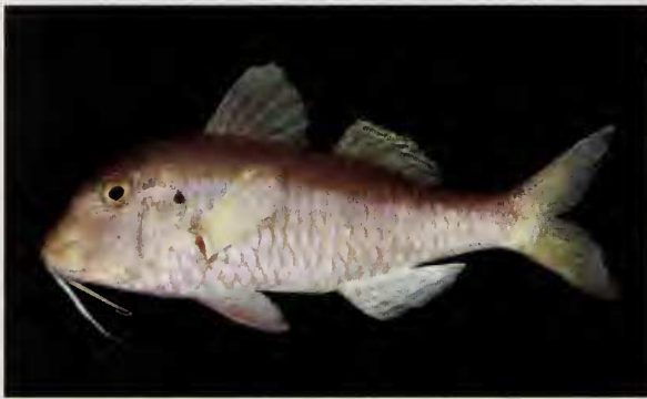
Fig. 1. Holotype of Parupeneus fraserorum , SAIAB 81385, 166.5 mm SL, KwaZulu-Natal.

Holotype. SAIAB 81385, 154.5 mm, South Africa, KwaZulu-Natal, reef off Pumula (near Hibberdene), 30°40.03'S, 30°35.40'E, reef, 57 m, hook and line, M.D. Fraser, 2 September 2008.